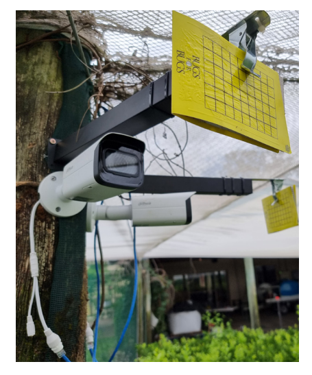
Low cost, high resolution cameras for monitoring sticky traps