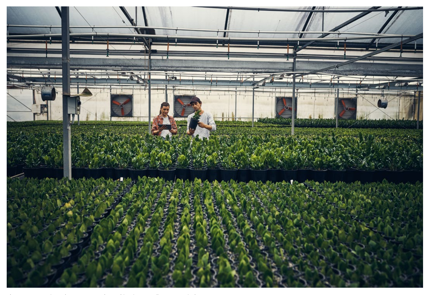
There are approximately 23,000 people working in Australia's nursery industry.