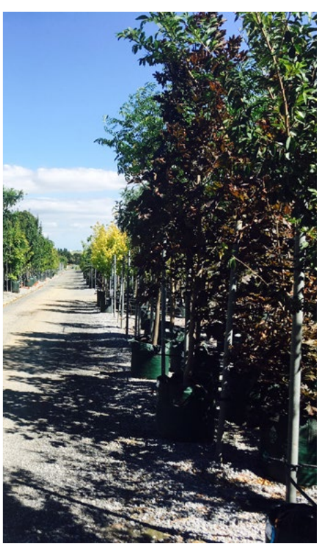
An estimated 1.6 billion plants are sold each year by greenlife producers.