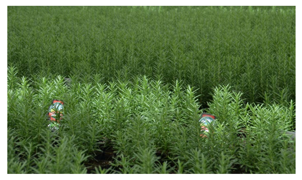
The nursery industry's total value to the Australian economy is approximately $2.29 billion.