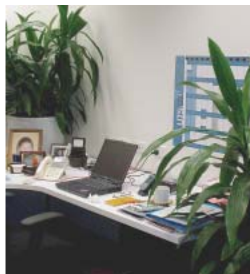
Six table sized pot plants (200 mm pots) are as effective as 3 floor standing pot plants (300 mm pots) in improving indoor air quality.

The offices were designed for single occupancy being 10–12 m 2 with a ceiling height of between 3–4m, which is comparable with