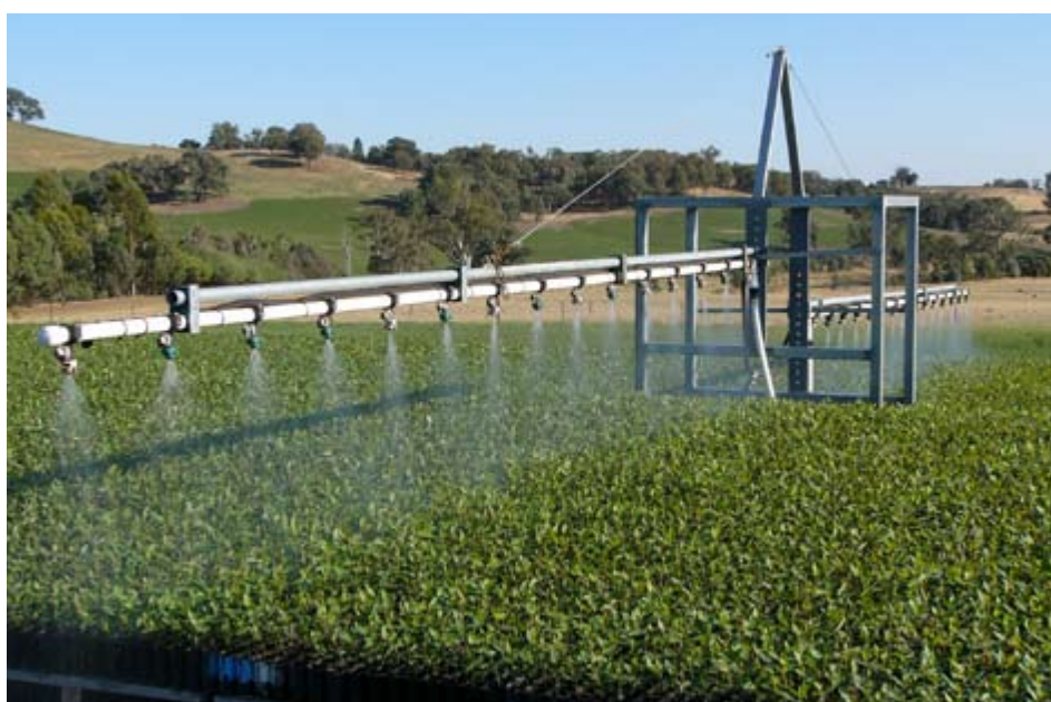
Unfortunately, many nurseries just water to keep their plants alive, which often means that the plants with the highest water use or most frequent demand dictate how the whole nursery is irrigated.

Applying the right amount of water at the right time minimises fertiliser leaching and moisture stress so plants are produced quickly and with the right internode spacings to command top price. And all this while saving water!