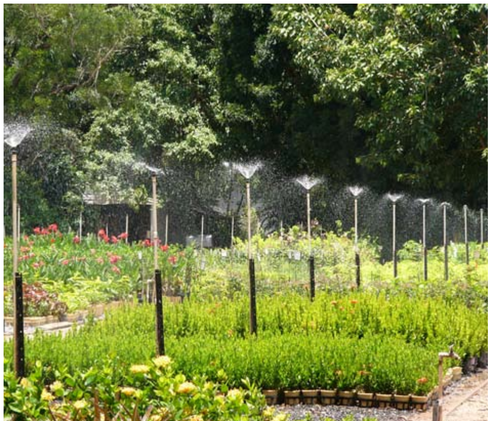
Many nurseries apply a simple scheduling system that sets different watering regimes for summer and winter with no regard for daily fluctuations, which can vary tremendously within seasons.