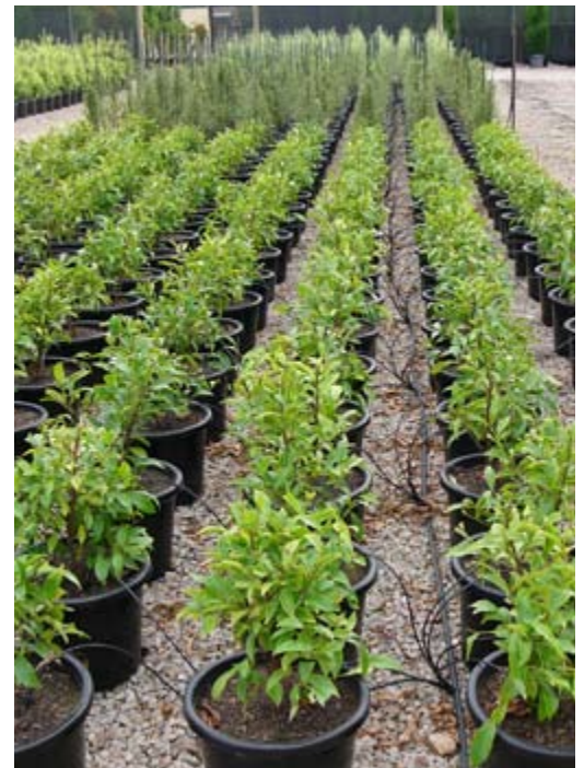
Applying the right amount of water at the right time minimises fertiliser leaching and moisture stress.

All these effects will affect your bottom line because nutrients and water are interrelated. Plant growth depends on the management of nutrients, which in turn depends on the management of water.