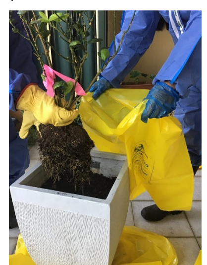
Citrus plant removals