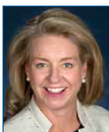
Senator the Hon. Bridget McKenzie

This is your opportunity to shape our future for the better.