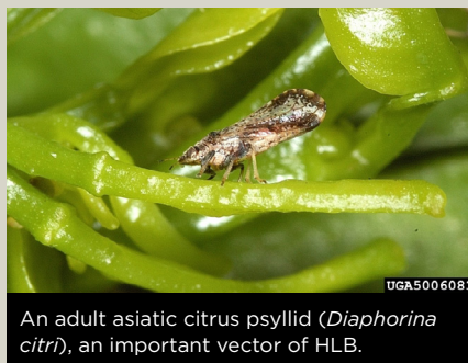
An adult asiatic citrus psyllid ( Diaphorina citri ), an important vector of HLB.

HLB affects all commercial citrus to varying degrees, in addition to Australian native citrus and some ornamentals in the Rutaceae family including orange jasmine ( Murraya spp). Trees often die within 5-8 years of infection. The disease is vectored by insects called psyllids and includes the Asiatic citrus psyllid ( Diaphorina citri ) and the African citrus psyllid ( Trioza erytreae ). Long-distance spread can occur by the movement of HLB-infected citrus plants, budwood and cuttings or by the movement of plant material infested with HLB-infected citrus psyllids. Movement of other host plants such as orange jasmine and curry leaf ( Bergera koenigii ) also pose a risk of introducing HLB-infected Asiatic citrus psyllids. Tropical storms and cyclones may also lead to long distance spread of infected Asiatic citrus psyllids from Indonesia and Papua New Guinea to northern Australia. Hence, despite the fact that HLB and the psyllid insects that transmit this disease are not known to occur in Australia, the potential for introduction is acute. Introductions into Australia are likely to occur as a result of illegal importation of infected plants or budwood or through the ingress of infected psyllids on plant material (host or hitchhiking on non-hosts), in aircraft or on wind currents.