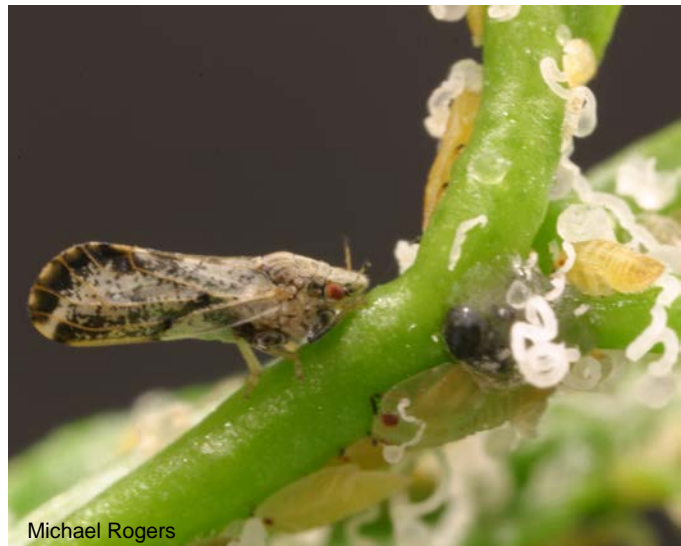
Fig. 2. Adult and nymphal ACP feeding on citrus.

Movement of psyllid-infested plant material, including fruit and foliage, is the most common method of long distance spread of D. citri ; it is a well established hitchhiker (Halbert et al. 2010) and can survive up to 10 days on detached stems and up to 20-30 days on detached stems with fruit (Hall & McCollum 2011). Ornamentals and food plants such as orange jasmine ( M. exotica ) and curry leaf ( Berbera koenigii ), respectively, have also been known to spread psyllids. Tropical storms and cyclones may lead to long distance spread of D. citri , as could illegal importation of host plants into Australia, including leaves such as kaffir lime, leaves or curry ( B. koenigii ) for cooking