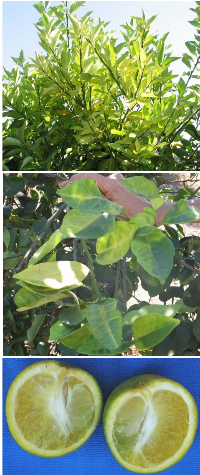
Fig. 5. Symptoms of HLB on citrus.

The bacteria live in the host's phloem and transmission occurs when infected plant material comes in close contact with uninfected plant material, whether that be by grafting or even contact with parasitic plants, e.g. dodder ( Cuscuta indecora ) (Bove 2006; Hartung et al. 2010b). As a result, any cuttings and marcots made from infected plants will also be infected. However, HLB is not present in infected plants in a uniform fashion. Some plants grafted from HLB infected trees onto uninfected rootstock may remain free of HLB (Gottwald 2010).