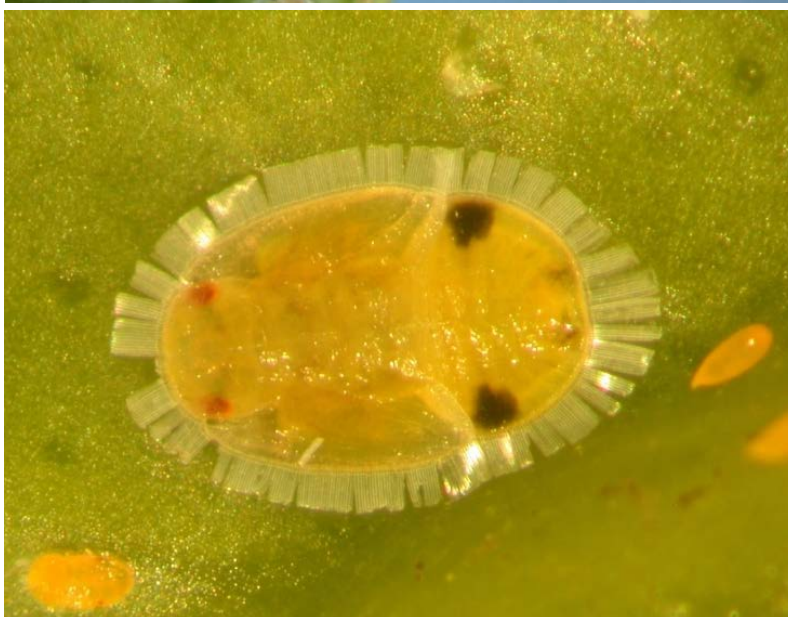
Fig. 4. Nymphal Trioza erytreae on citrus.