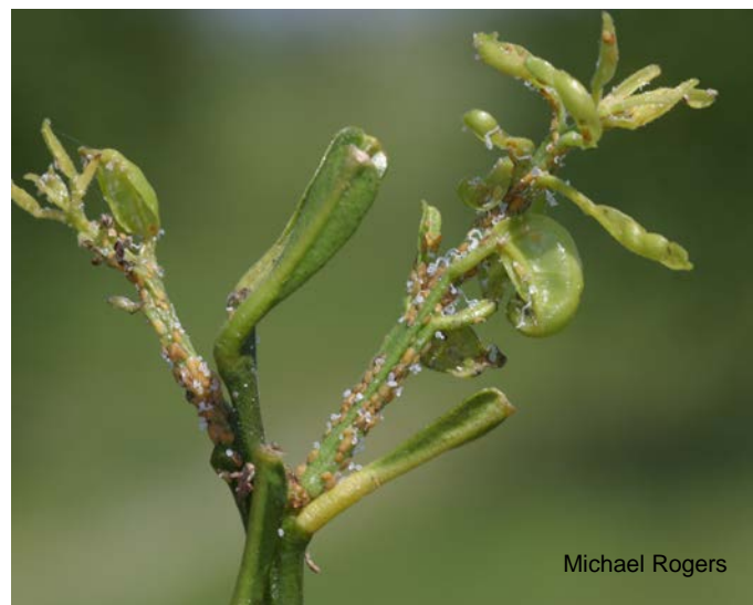
Fig. 3. Damage caused by large numbers of ACP (above) and black-sooty mould and waxy tubules on citrus leaves.