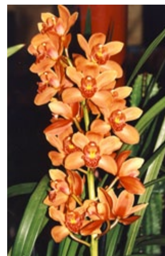
'Scott's Sunrise Aurora' Cymbidium Orchid – the first plant granted a patent in Australia

A number of cases have clarified that in Australia, plant varieties and processes in breeding of plants are patentable. The first plant granted a patent in Australia was the 'Scotts Sunrise Aurora' Cymbidium Orchid from Adelaide Orchids Pty Ltd in May, 1981.