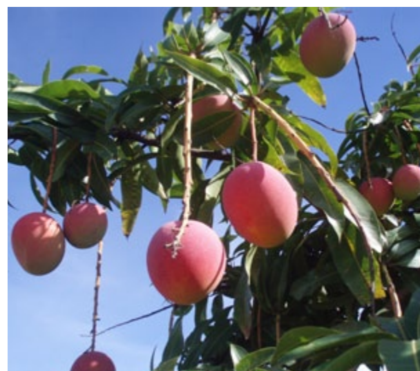
Mango variety 'B74' was bred by Qld Dept of Primary Industries and protected by PBR in Australia and by a plant patent in the USA. It is marketed by One Harvest under the registered trade mark Calypso®.

Here are some examples of plants/plant processes that have been patented in Australia so far: